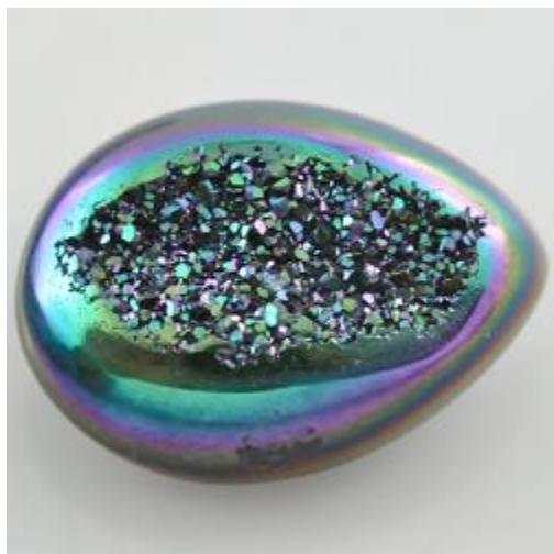
Window Drusy Quartz

Window and Flat are two types of drusy quartz. Window drusy comes with only small area covered with crystals and Flat drusy comes with completely covered with crystals. Here is the picture