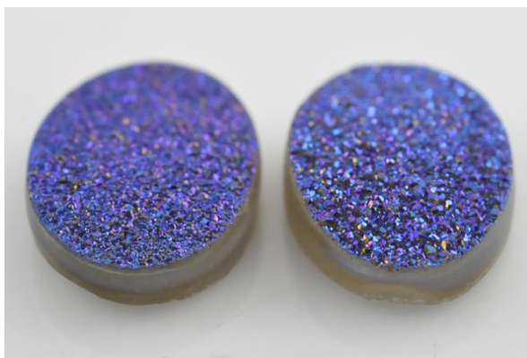
Flat Drusy Quartz